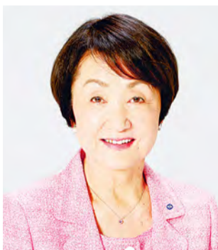
Fumiko Hayashi Mayor of Yokohama

Yokohama is truly brimming with attractions and appeal. A port where ships from other countries come and go, Western-style buildings exuding the city's history from the days of the opening of its port, Sankeien Garden, Chinatown, and a sleekly modern waterfront area. Its peripheral districts are blessed with a wealth of greenery and afford enjoyment of the change of seasons in their forested tracts.