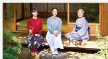
© 2018 "Nichi Nichi Kore Kojitsu" Production Committee