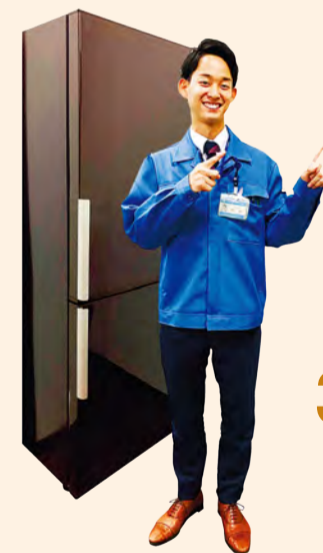
Begin by doing what you can.

Make meals only in amounts that will be eaten in one sitting. If there are any leftovers, skillfully preserve them in the refrigerator or freezer.