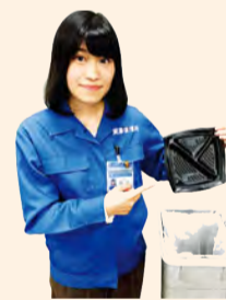
Put waste into waste bins.

Containers for mayonnaise and fermented beans are also types of plastic containers and packaging.