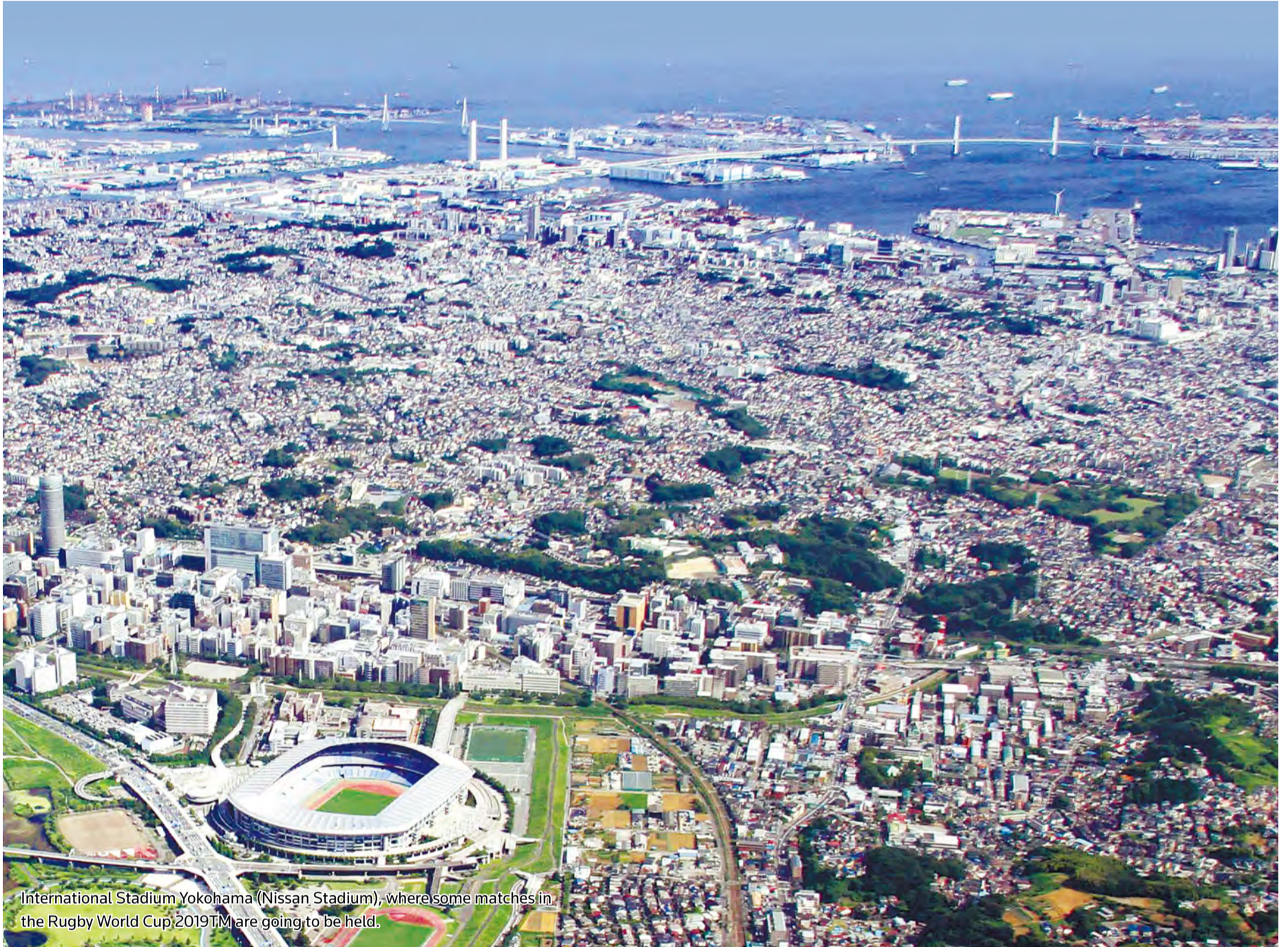
International Stadium Yokohama (Nissan Stadium), where some matches in the Rugby World Cup 2019™ are going to be held.